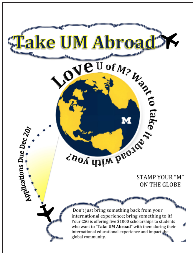
Image 2: The Take U-M Abroad Program conceptualized and created by CSG Intern Nicole Mott