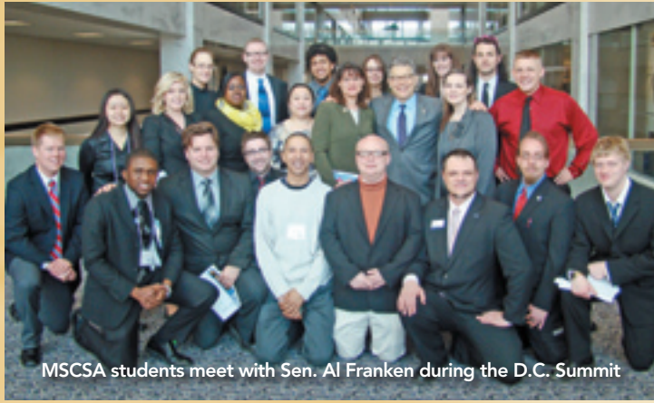
MSCSA students meet with Sen. Al Franken during the D.C. Summit

MSCSA supported Senator Franken's "True Cost of College Act" legislation, which aims to standardize financial aid award letters to make them more comprehensible for families. The bill would particularly help in comparing aid packages offered by various higher education institutions. MSUSA and the Minnesota Student Association also supported this legislation, which was introduced in the Senate last spring.