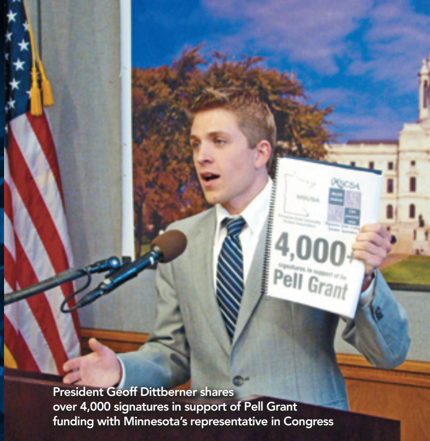
President Geoff Dittberner shares over 4,000 signatures in support of Pell Grant funding with Minnesota's representative in Congress