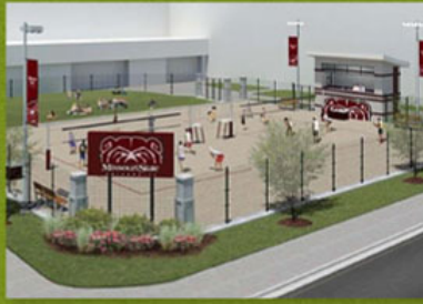
Sand volleyball complex