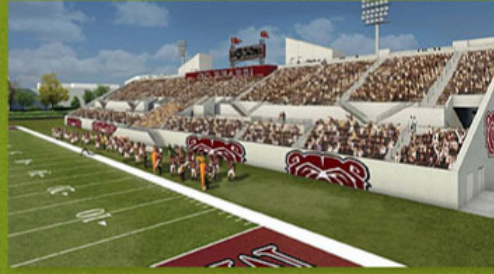
Student seating of Plaster Sports Complex