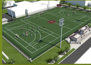
Lacrosse and field hockey complex