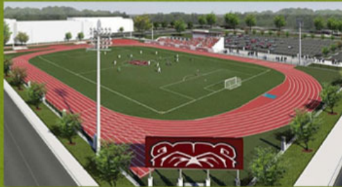
Soccer, track and field facilities