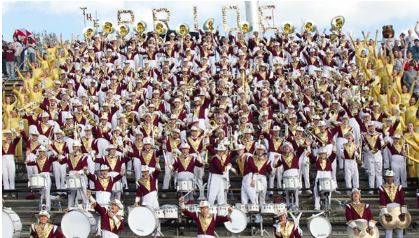
Pride Band members and fans commemorate their final sit on the wooden bleachers at Plaster Sports Complex.