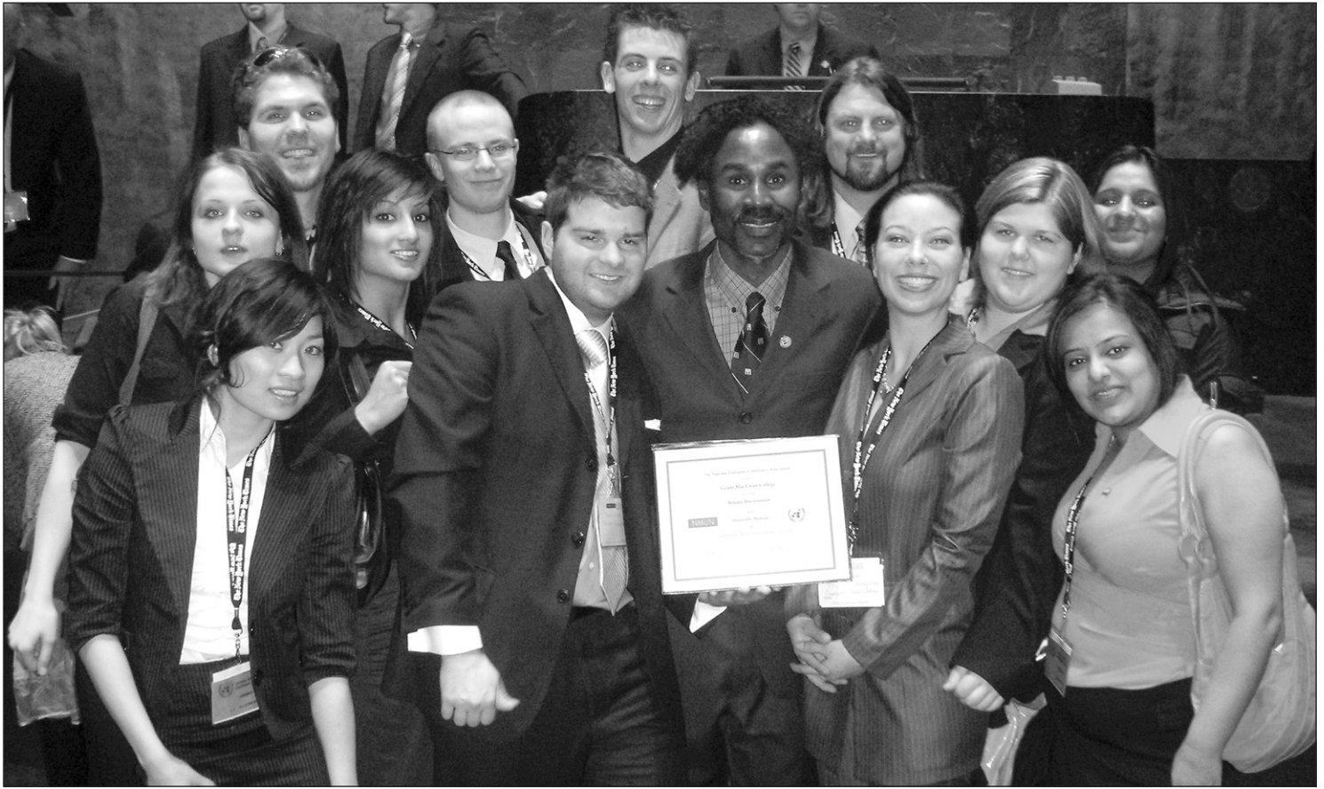
United Nations Club