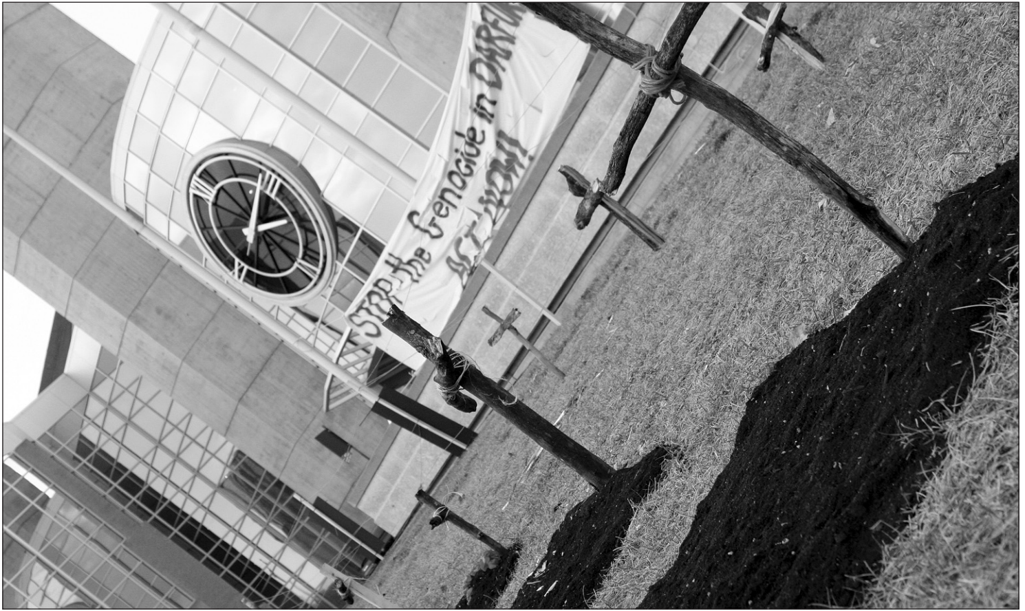
Simulation Refugee Camp