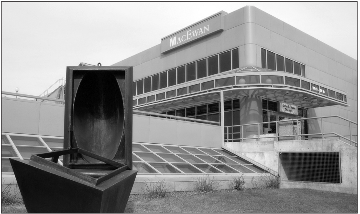
Centre for the Arts Campus