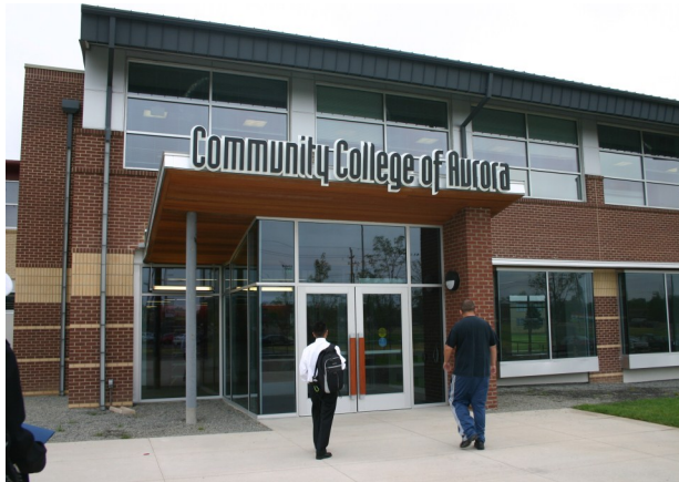
Lowry West Quad