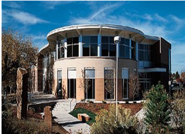
CentreTech Campus Student Centre