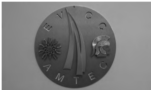
AWS/AMTEC, Club of the Year 2017-2018

The College and Student LIFE further recognizes that students should be free to organize and participate in voluntary associations of their choosing, subject to College policies and ensuring that such associations are neither discriminatory in their treatment of other members or the campus community nor operate in a manner which interferes with the rights of others.